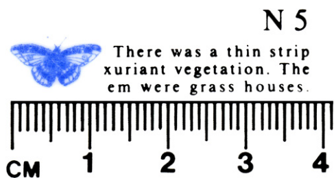
FIG 1. Image of butterfly and N5 fixation targets. For the N5 target participants were asked to continually identify the words and letters on the N5 line.