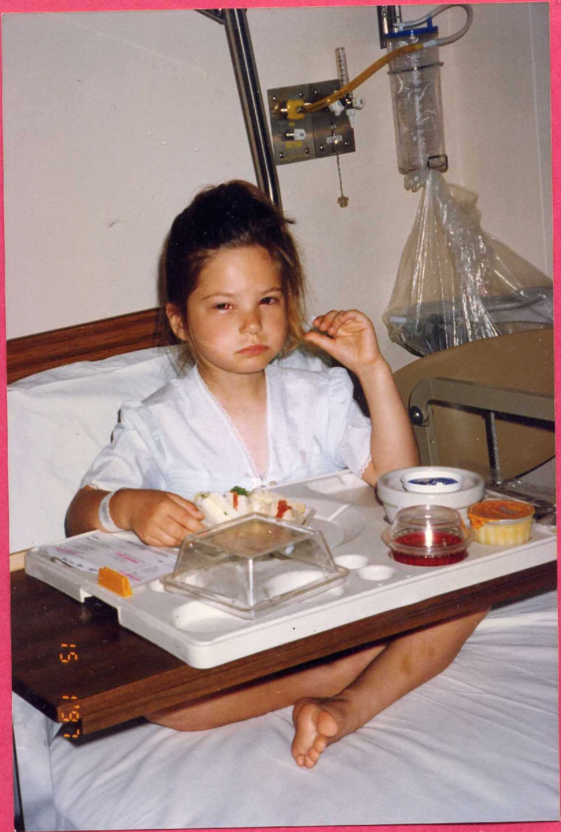
THE HOSPITAL SERVED MY SANDWICHES JELLY ICE CREAM A JUICE IN BED