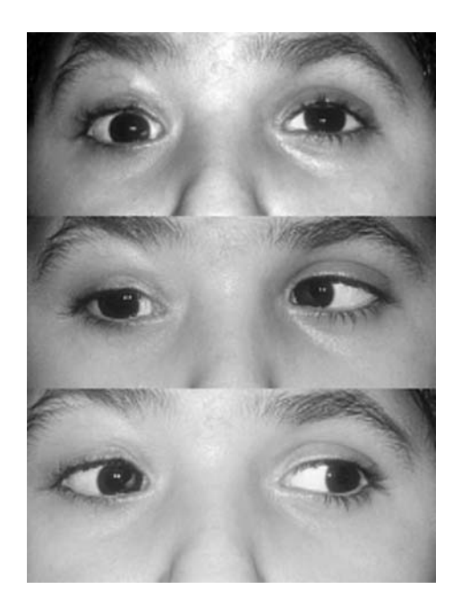
Figure 3 Case 3, postoperate alignment and horizontal rotations.

A boy aged 4 years old fell from the third floor onto the street sidewalk with resulting hemiparesis and right third cranial nerve paralysis. A frontalis sling operation was performed on the right upper lid 2 months after the injury to prevent amblyopia. Six months after the accident, the right eye position was 45 degrees exotropia and 10 degrees hypotropia (fig 2). There was no adduction or vertical movement. Lateral rectus disinsertion and reattachment to the orbital rim was performed, together with superior oblique tenotomy and medial rectus resection of 12 mm. The medial rectus was sutured 6 mm superior to the original horizontal line of insertion. Eighteen months postoperatively the right eye